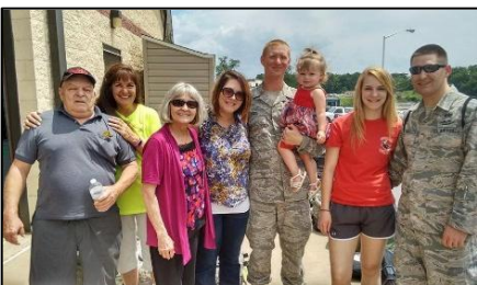
Four generations happily reunited at the 171 st Airwing.

During the Open House, a KC-135 landed carrying a unit that had been deployed to Latvia, where they were helping to rebuild a mission. The emotions that were felt as loved ones were reunited spread like a tidal wave across the hangar.