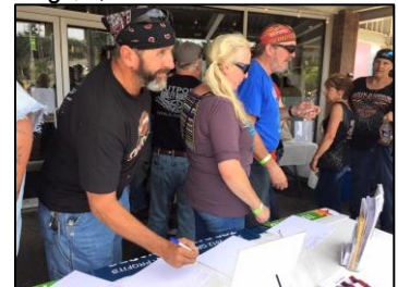
Attendees at the Gianna Via Motorcycle Run signed cards to be sent to overseas troops.

On Sunday, July 26 th Gianna Via Restaurant & Bar in conjunction with the Mon Valley H.O.G. Chapter 1773 hosted a Motorcycle Ride for OTA. After a beautiful ride through southwestern PA, Gianna Via hosted a catered meal, a 50/50 raffle and Chinese Auctions, raising $1,339 for OTA!