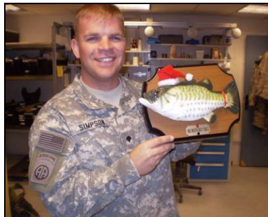
We had a blast with this project for the HHD TF Corsair in Afghanistan – providing warm clothes, Under Armour, electronics and some other surprises for this aviation unit's Christmas party. Billy the Bass was a big hit!