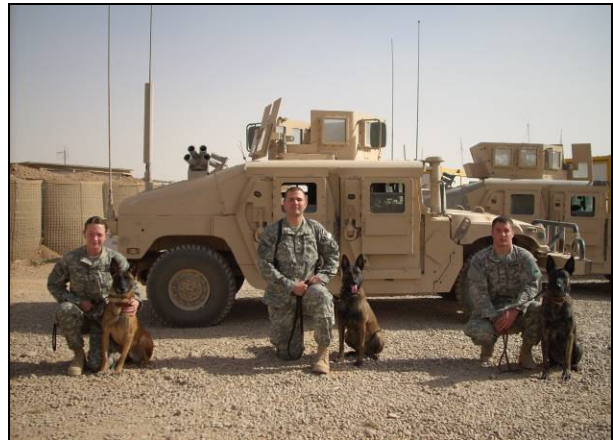
OTA was excited to provide not only for the soldiers of this K-9 unit of 1/3 ACR, but for their working dogs as well – Soldiers and pooches all received specially requested snacks, and the pups got some new rubber chew toys, too!