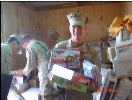
These Marines of 3/21 Kilo Company were thrilled with the board games and sports equipment OTA sent them.

Meet some of the troops who have touched our lives. Their smiles are our biggest reward!