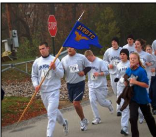
Members of Pitt Air Force Cadets (above), CMU's ROTC, and the members of Pitt Law School Veterans group provided a dramatic influence.