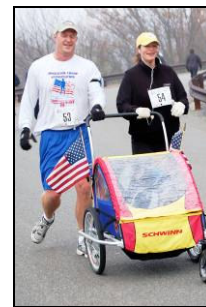
The competitive racers, recreational runners, puppy walkers and stroller-pushers all enjoyed themselves during the race.