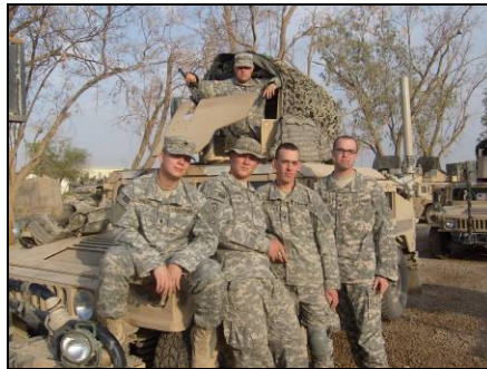
These soldiers of Btry 5/2 SCR enjoyed the Under Armour t-shirts provided by OTA.