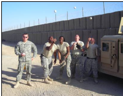
These soldiers of ARSIC-S, a South Carolina National Guard and maintenance unit, love playing with the baseball and football equipment OTA sent them. Our Point of Contact tells us playing sports has made them a more cohesive unit.