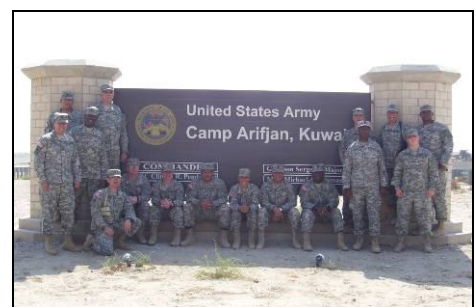
These troops of HHC 1st TSC were happy to get care packages from OTA, including snacks, hygiene supplies and entertainment items.