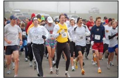
In addition to striving for personal achievement, runners received great prizes at the post race party.

The program shares first-hand accounts straight from personal interviews with our nation's Armed Forces. Interviews, news and updates are available 24/7 at www.TalkingWithHeroes.com