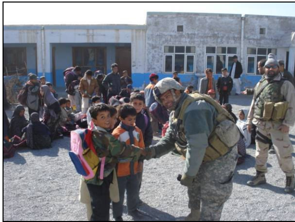
OTA sent the soldiers of CJSOTF-A TF 71 not only their own requested "wish list" items, but also school supplies for this Civil Affairs unit to hand out to orphans in this Afghan village .