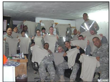
The soldiers of the 1015 th Maintenance Company show off the Under Armour shirts OTA sent them.