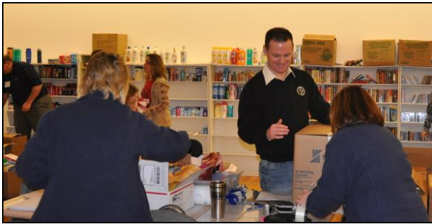
Mayor Ravenstahl packs for the troops

We may not have won the Super Bowl, but the city and our troops definitely came out on top!