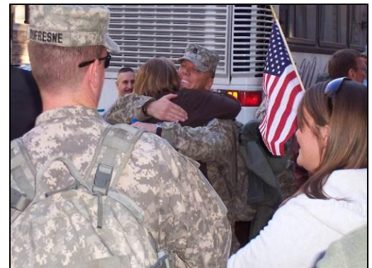
A day almost a year in the making, these soldiers return home to loved ones after a successful deployment to Afghanistan.