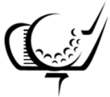
OTA CHARITY GOLF TOURNAMENT

It may be winter, but golf season is just around the corner and OTA is very excited to host our 5th annual golf outing for the troops!