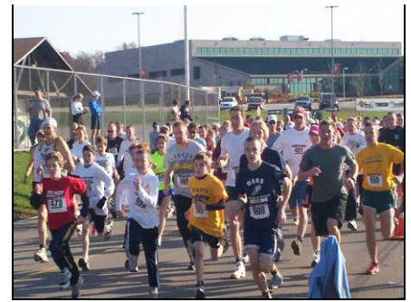
On Sunday, November 8 th , nearly 300 runners and walkers gathered in the Hampton Community Park to take advantage of the unusually warm temperatures and sunny sky.

Now that is a prize we can all treasure.