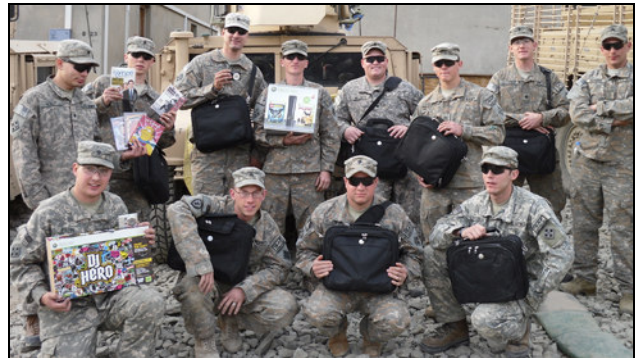
The soldiers of 3 rd Platoon, Bravo Troop, 3-69 Cavalry show the items received from efforts of the COP Keating Fund

These soldiers will never forget the day they lost eight of their brothers, and Americans will never forget the sacrifices all of our uniformed men and women make everyday. As a testament to the Legion's efforts, more than $100,000 in funds and supplies were donated from various groups like OTA, as well as major US companies, to reach out to the soldiers who endured so much in this battle.