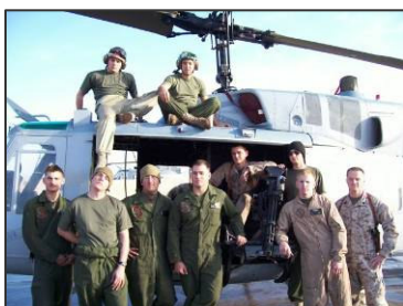
OTA sent Under Armour to this unit of Light Attack Helicopter Marines.

Thanks to you, OTA, you made that happen for a lot of people. The decorations and gifts just made everyone so happy and filled with Joy....THANK YOU SO MUCH!!!"