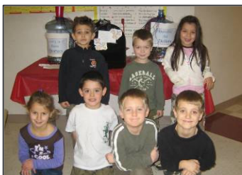
Streams students sent their letters, the banner and classroom pictures to the soldiers.

Streams Elementary School - Upper St. Clair, PA: With a goal to collect $280 to provide for the 28 soldiers in the 332 Expeditionary Logistics Readiness Squadron (Detachment 2), the Streams Outreach Committee organized an entire week of coin collections, theme days, and a letter writing campaign.