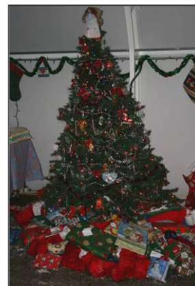
The sailors did a great job trimming the tree with the decorations and gifts OTA sent.

So many people were so moved and touched by all the Christmas spirit and when we told them that the gifts were donated by you guys they couldn't believe that such generosity could come from total strangers.