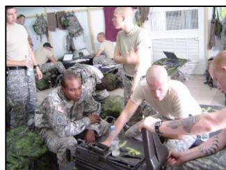
OTA sent this company of soldiers in Iraq tactical supplies like militech oil, boresnakes, spotting scopes and Nomex gloves.