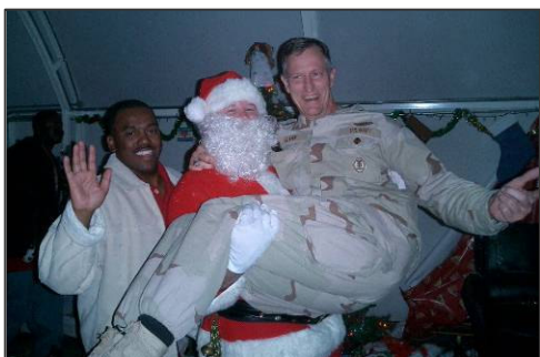
The troops celebrated the holidays, complete with Christmas tree, presents, and Santa.

You have no idea how happy you made everyone, not just the men and women in our unit, but the different units on the base. We had over 200 people attend!!! Everyone came out to enjoy the party and loved the decorations and they are still talking about how pretty and nice everything was. You guys provided all kinds of treats and snacks and the DVDs, CDs, socks, and calling cards were a HUGE hit!!!