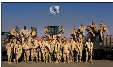
This Air Force unit received their "wish list" of snacks and hygiene items from OTA.