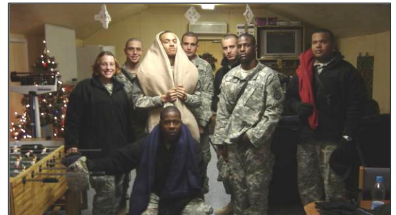
Fleece blankets from OTA will help keep the soldiers warm this winter.