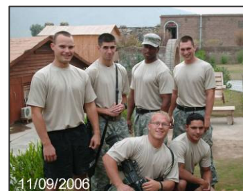
These soldiers show off the Under Armour OTA sent them.