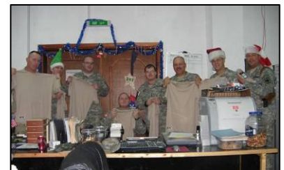
Soldiers doing force protection in Baghdad show off the Under Armour OTA sent them.