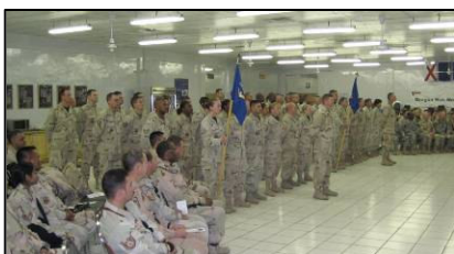
OTA sent personal supplies and snacks to a company of U.S. Airmen training the Afghan army.