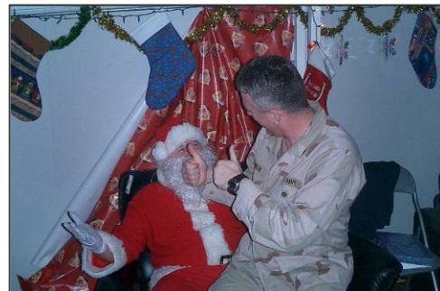
Santa even paid a visit!

"The party was really great...everyone enjoyed it and they are still talking about it. As you can see from the pictures, your decorations and gifts helped make the party a success! We had gifts under the tree and a raffle. The people whose number we called got to go under the tree and pick a gift. They were so excited when their number got called, like they won the lottery. It was funny!!!"