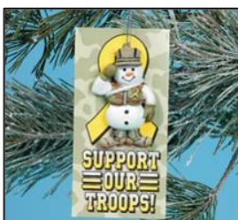
The nurses raised over $1,300 for two units with these snowmen!

Dozens of companies, individuals, churches, schools and civic groups have adopted units. We thank each of them for their generosity and compassion, and would like to share some of their special stories.