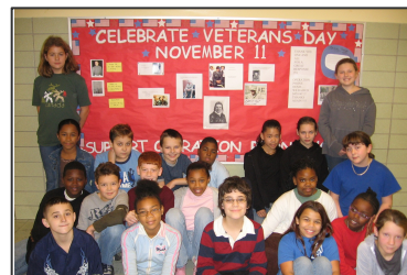
One of the Minadeo students said he never realized how doing something so small could mean so much to others.

The students have become pen-pals with some of the soldiers, and are currently collecting school supplies for the soldiers to give to children in Iraq.