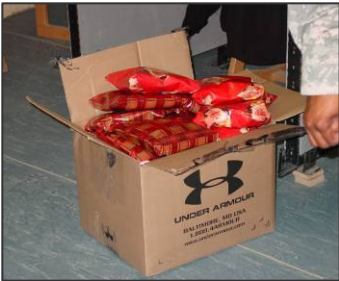
Soldiers found wrapped presents...