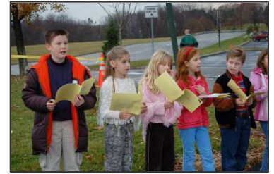
The St. Mary's Children's Choir sang patriotic hymns along the race route.