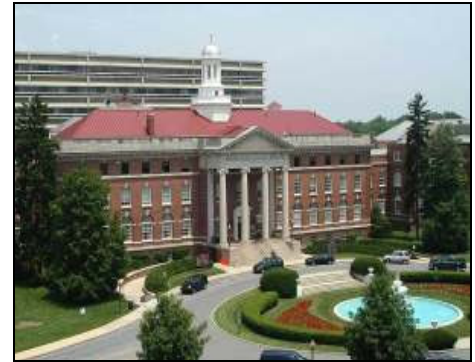
Walter Reed Army Medical Center

We would like to thank the Executive Services Staff for the assistance in getting these items to the patients. They were a dream to work with, and their concern and passion for their patients is heart-warming.