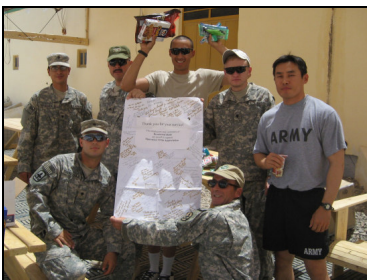
Brentwood Bank of S. Park, PA adopted the Soldiers of 158th Infantry, and customers and employees signed a banner to show their support.