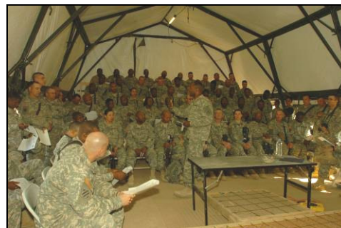
OTA sent the soldiers of HHOC STB G3AIR 3ID their “wish list” items of sun glasses, foot powder, and snacks.