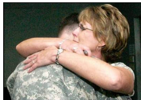
Mother and son reunite.