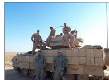
B-Trp KMTB received their “wish list” items from OTA: ear plugs, ACU shirts, ballistics glasses, and DVDs.