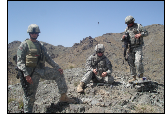
Soldiers of the 774 th work to keep their fellow soldiers and the Afghani population safe from explosives.