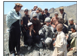
Working with and living so closely to the Afghan people, the soldiers of the 774th built trust and forged new friendships.