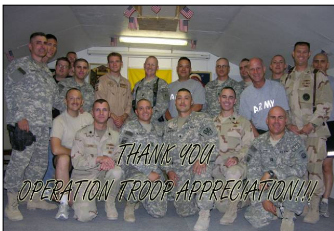
The soldiers of HSC 122ND ASB Retention thank OTA for their gifts of Under Armour shirts, CDs, and nutritional supplements.