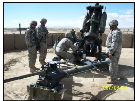
This Airborne unit, building a base in remote Afghanistan, received basic supplies and solar showers from OTA, making their base more comfortable.