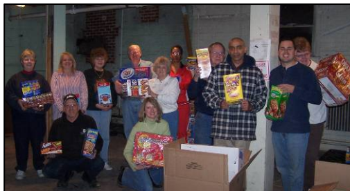
OTA volunteers help pack up dozens of boxes of items for our wounded warriors.