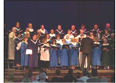
The Brandywine Area Community Choir raised more than $7500 for OTA this spring.