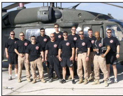
OTA sent Under Armour shirts and MWR items to this Medevac Air Ambulance platoon, who provides emergency medical attention for US soldiers in Afghanistan.