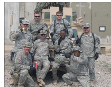
OTA sent this squad of a Military Training Unit the flashlights they show off here, as well as Nomex gloves and utility knives.