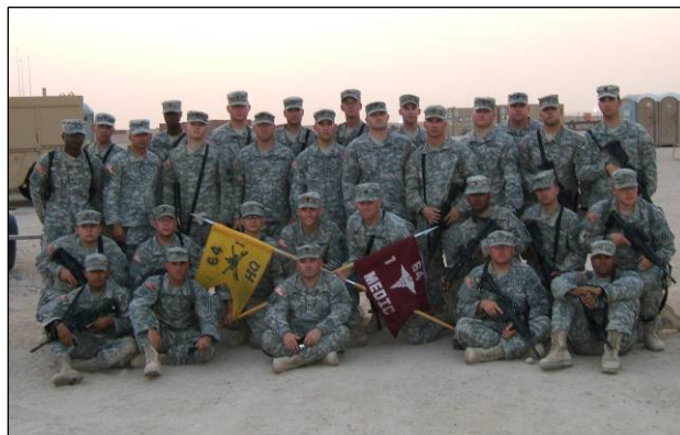
Medics of the 1-64 Armor Battalion

Donations from Under Armor, ABATE, and Shop 'N Save grocery stores (refer to "Local Bike Group..." article on p. 7) have enabled us to provide needed items for hundreds of wounded warriors. While we hope the day comes when our help is no longer needed, we will continue to support these brave men and women through our thoughts, prayers and these special gifts.