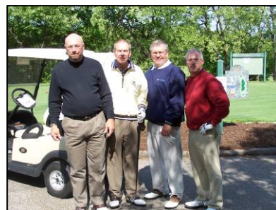
Golfers get ready to hit the links!

We are grateful to the many sponsors, golfers and volunteers who worked so hard to make this event a success. We are already planning next year's outing, so stay tuned for details.