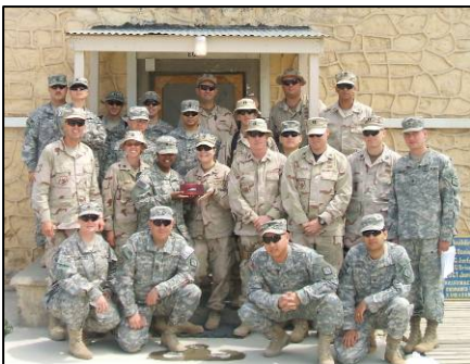
Soldiers from an Explosives Ordnance Disposal unit wear the ballistics glasses OTA sent them to aid their explosives diffusion duties.