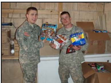
OTA sent a company of Field Artillery soldiers in Iraq snacks and MWR items to help keep them comfortable.

OTA has provided "wish list" items for more than 25,000 troops since our inception in July 2004.