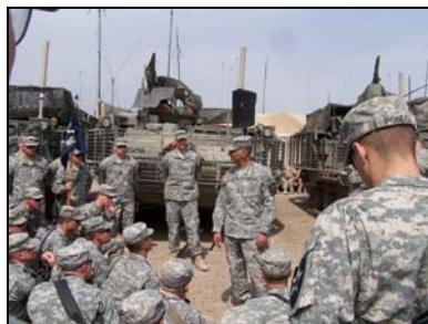
This platoon of infantry soldiers in Iraq received head lamps, Under Armour and other tactical supplies from OTA to aid them in their combat missions.