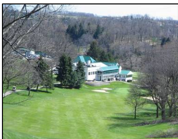
Rolling Hills Country Club.

The annual OTA golf outing took place this year on May 18th at the Rolling Hills Country Club in McMurray, PA. Eighty-four golfers came out to compete in a scramble tournament to raise money in support of our deployed troops, and the day proved to be an overwhelming success for OTA!