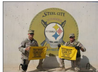
Steeler's fans in the Air Force don't forget the Pittsburgh home team while in Iraq!