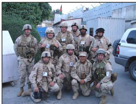
An Air Force Logistics Embedded Training Team for the Afghan National Army received PS2 system and games, DVDs, and CDs.