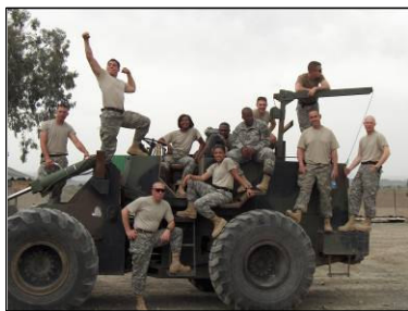
Soldiers in the 151 st Trans. Company receive personal care items, barber kits, and vinyl records (Afghanistan).

By supporting OTA through these two campaigns, you'll be doing your part to make sure our troops are taken care of throughout 2007.