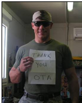
B Company, 2-8 Infantry, 4 th Infantry soldiers receive Under Armour t-shirts from OTA (Iraq).