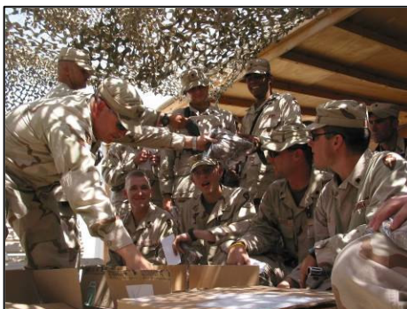
Headquarters company of the 3-112 th Armored receives Under Armour from OTA (Iraq)