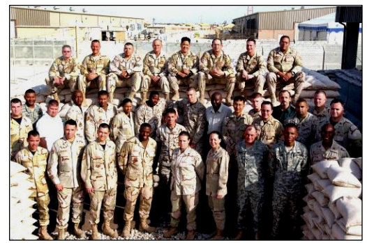
Soldiers at Central Command received Under Armour, sandals, towels and personal care items from OTA (Qatar)