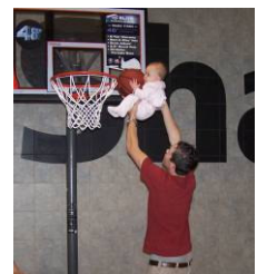
A perfect shot by our youngest Hoops for Heroes participant!