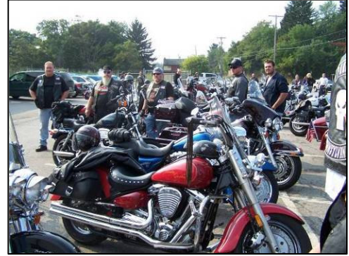
Bikers from Pennsylvania, Ohio, Virginia and West Virginia joined OTA for the Screaming Eagles Bike Run.