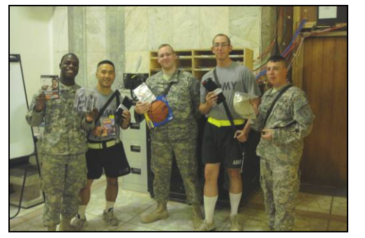
Unit: HQ Btry, 1-7 Field Artillery, Ft. Riley, Kansas Mission: Secure the international zone, perform

"Wish list" items: Phone cards, snacks, hygiene, golf balls, games