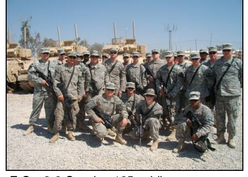
Unit: E Co, 3-8 Cavalry, 125 soldiersMission: Recover and maintain Army vehicles in Iraq"Wish list" items: Ballistic eye protective glasses