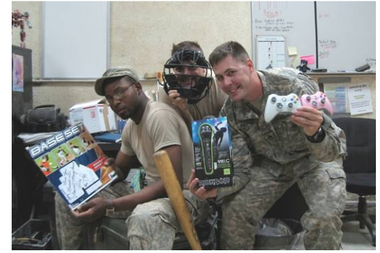
Unit: HSC, NNC-I (HQ Plt), Ft. Lewis, Washington

"Wish list" items: Snacks, cotton t-shirts, hygiene supplies