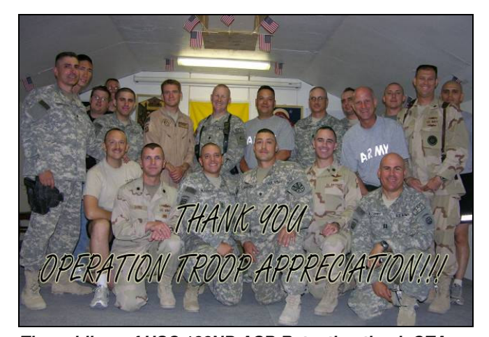
The soldiers of HSC 122ND ASB Retention thank OTA for their gifts of Under Armour shirts, CDs, and nutritional supplements.