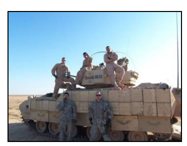
B-Trp KMTB received their "wish list" items from OTA: ear plugs, ACU shirts, ballistics glasses, and DVDs.