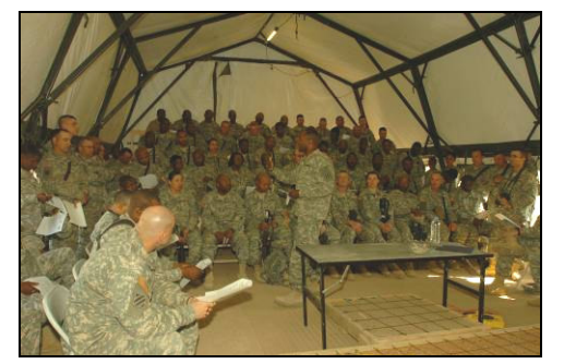
OTA sent the soldiers of HHOC STB G3AIR 3ID their "wish list" items of sun glasses, foot powder, and snacks.