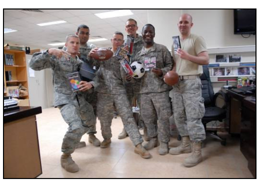
Unit: JTF 435-J6

"Wish list" items: Pool sticks, ping pong supplies, boot insoles, gloves, guitars, snacks and hygiene supplies