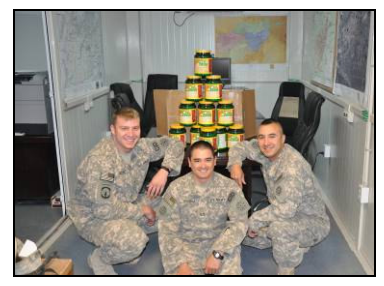
Unit: Kandahar CID Office

"Wish list" items: sports equipment, video gaming and games