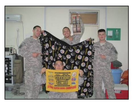
Unit: Medical Platoon, HHC,1-87 Infantry Battalion

"Wish list" items: Under Armour® shirts and socks