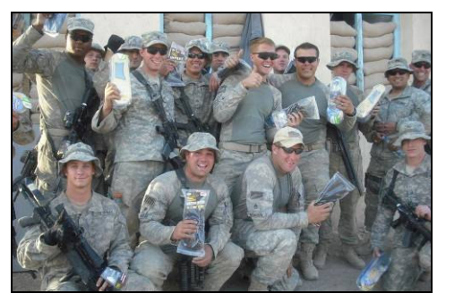
Unit: HHT 4-73rd Cavalry

So far during 2010, OTA has provided "wish list" items to 17,000 troops , items ranging from sports equipment , Under Armour® moisture-wicking shirts , phone cards , pillows , sheets , personal hygiene , and snack items . Here are a few of the smiling faces and the "wish list" items they received from OTA!