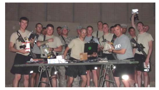
Unit: A Company, 1-87 Infantry

"Wish list" items: Supplies for traveling wounded soldiers, blankets, bread maker mix, hair clippers, socks