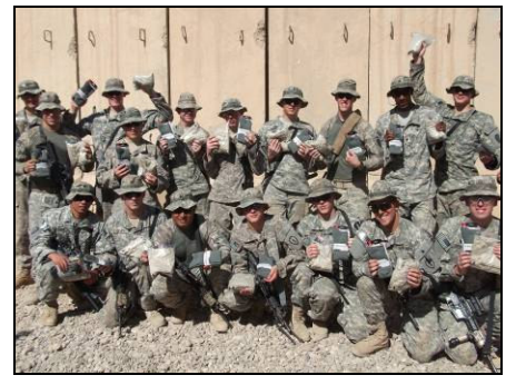
Unit: B Company, 1-14 Infantry

"Wish list" items: Protein mix, snacks, Under Armour® shirts