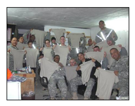
The soldiers of the 1015<sup>th</sup> Maintenance Company show off the Under Armour shirts OTA sent them.