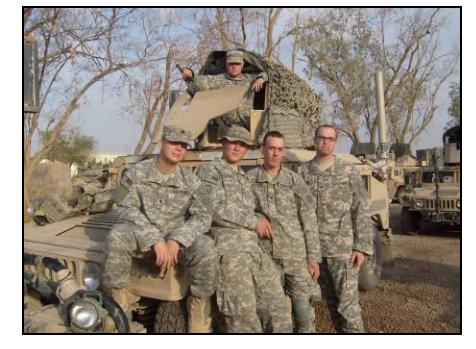
These soldiers of Btry 5/2 SCR enjoyed the Under Armour t-shirts provided by OTA.