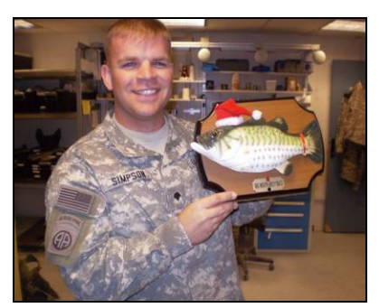
We had a blast with this project for the HHD TF Corsair in Afghanistan – providing warm clothes, Under Armour, electronics and some other surprises for this aviation unit's Christmas party. Billy the Bass was a big hit!