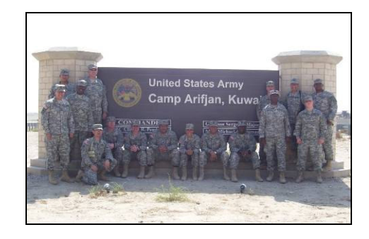
These troops of HHC 1st TSC were happy to get care packages from OTA, including snacks, hygiene supplies and entertainment items.