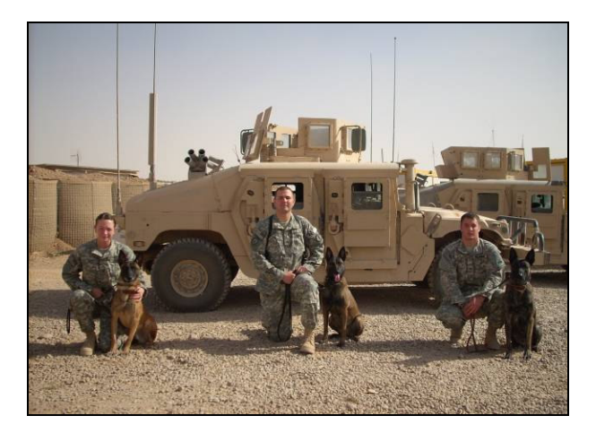
OTA was excited to provide not only for the soldiers of this K-9 unit of 1/3 ACR, but for their working dogs as well – Soldiers and pooches all received specially requested snacks, and the pups got some new rubber chew toys, too!