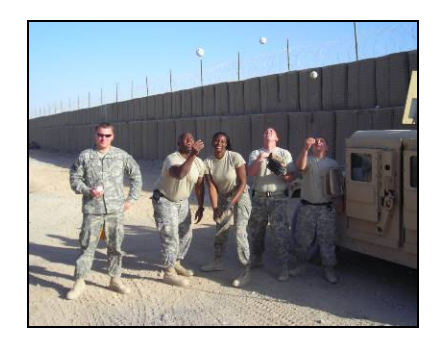
These soldiers of ARSIC-S, a South Carolina National Guard and maintenance unit, love playing with the baseball and football equipment OTA sent them. Our Point of Contact tells us playing sports has made them a more cohesive unit.