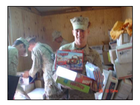
These Marines of 3/21 Kilo Company were thrilled with the board games and sports equipment OTA sent them.

Meet some of the troops who have touched our lives. Their smiles are our biggest reward!