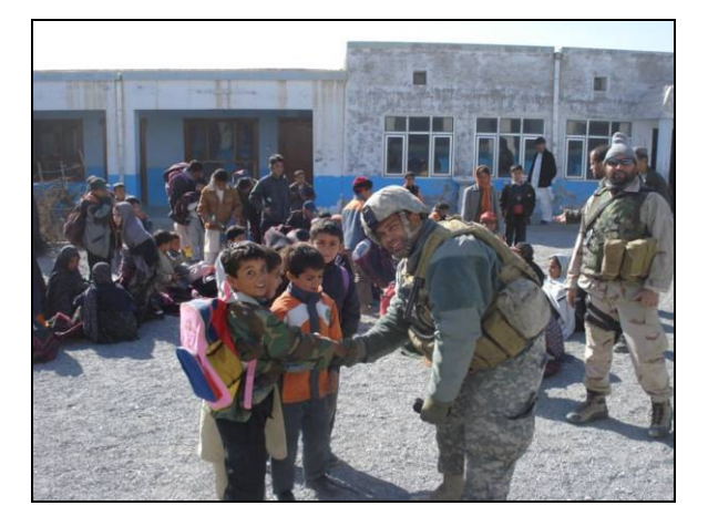
OTA sent the soldiers of CJSOTF-A TF 71 not only their own requested "wish list" items, but also school supplies for this Civil Affairs unit to hand out to orphans in this Afghan village.