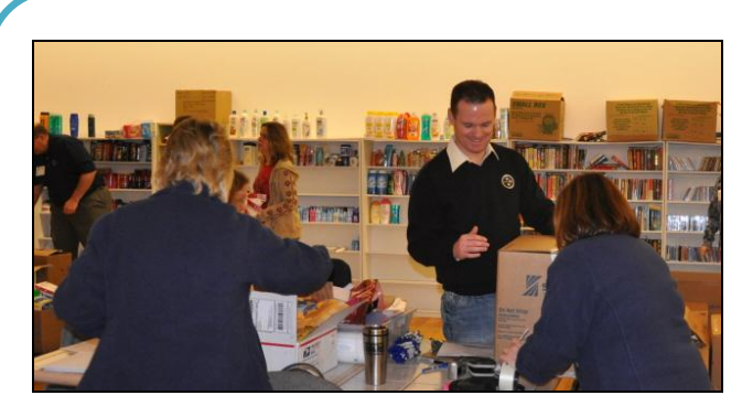
Mayor Ravenstahl packs for the troops

We may not have won the Super Bowl, but the city and our troops definitely came out on top!