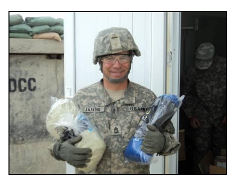
Unit: B-416th CA BN

"Wish list" items: Under Armour shirts®, hygiene items