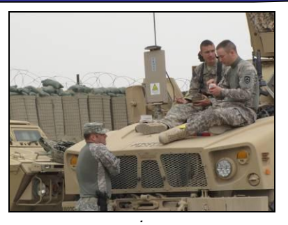
Unit: 1092 EN BN S3 C

"Wish list" items: Snacks, hygiene, entertainment items