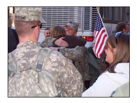
A day almost a year in the making, these soldiers return home to loved ones after a successful deployment to Afghanistan.

Operation Troop Appreciation (OTA) is dedicated to members of our Armed Forces serving and sacrificing for our country. By providing them with "wish list" items to raise their morale and to aid in the success and safety of their missions, we present a united front to our deployed military by supporting them as individuals. We do this because each and every one of them: