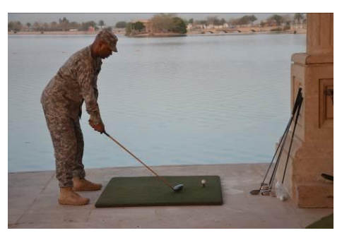
Unit: USF-I, B CO

Our troops' "wish list" items range from entertainment items, eye protective glasses, Under Armour® moisture-wicking shirts to phone cards, bedding, personal hygiene, and snack items. Here are a few of the smiling faces and the "wish list" items they received from OTA!