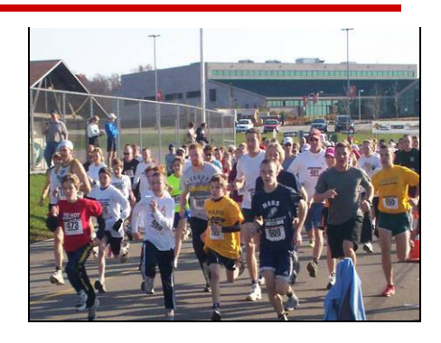
On Sunday, November 8<sup>th</sup>, nearly 300 runners and walkers gathered in the Hampton Community Park to take advantage of the unusually warm temperatures and sunny sky.

Now that is a prize we can all treasure.