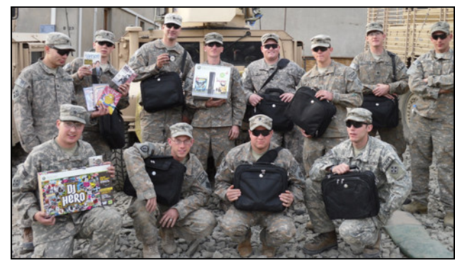
The soldiers of 3<sup>rd</sup> Platoon, Bravo Troop, 3-69 Cavalry show the items received from efforts of the COP Keating Fund

These soldiers will never forget the day they lost eight of their brothers, and Americans will never forget the sacrifices all of our uniformed men and women make everyday. As a testament to the Legion's efforts, more than $100,000 in funds and supplies were donated from various groups like OTA, as well as major US companies, to reach out to the soldiers who endured so much in this battle.