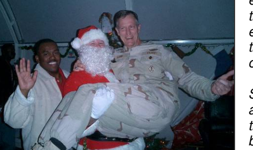
The troops celebrated the holidays, complete with Christmas tree, presents, and Santa.

You have no idea how happy you made everyone, not just the men and women in our unit, but the different units on the base. We had over 200 people attend!!! Everyone came out to