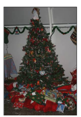
The sailors did a great job trimming the tree with the decorations and gifts OTA sent.

One guy in the Army told me the next day he was depressed and didn't think he was going to make it through the holidays, but then he was