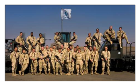
This Air Force unit received their "wish list" of snacks and hygiene items from OTA.