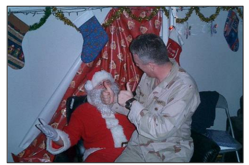
Santa even paid a visit!

"The party was really great...everyone enjoyed it and they are still talking about it. As you can see from the pictures, your decorations and gifts helped make the party a success! We had gifts under the tree and a raffle. The people whose number we called got to go under the tree and pick a gift. They were so excited when their number got called, like they won the lottery. It was funny!!!