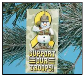
The nurses raised over $1,300 for two units with these snowmen!

Dozens of companies, individuals, churches, schools and civic groups have adopted units. We thank each of them for their generosity and compassion, and would like to share some of their special stories.