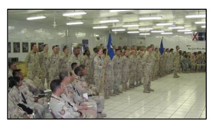
OTA sent personal supplies and snacks to a company of U.S. Airmen training the Afghan army.

Operation Troop Appreciation PO Box 14550 Pittsburgh, PA 15234 www.OperationTroopAppreciation.org