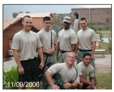
These soldiers show off the Under Armour OTA sent them.