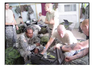
OTA sent this company of soldiers in Iraq tactical supplies like militech oil, boresnakes, spotting scopes and Nomex gloves.

More than 20,000 troops have received "wish list" items from OTA; we reached almost 12,000 during 2006.