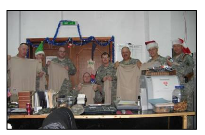
Soldiers doing force protection in Baghdad show off the Under Armour OTA sent them.