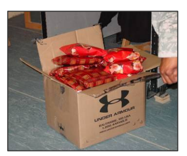
Soldiers found wrapped presents...