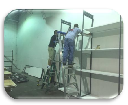
building in progress...