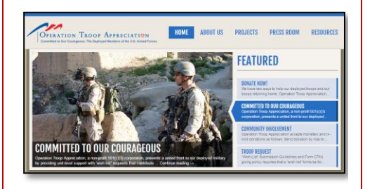
Visit <a href="https://www.OperationTroop">www.OperationTroop</a> <a href="https://www.OperationTroop">Appreciation.org</a> today!

Take some time to surf through the pages to learn more about OTA.