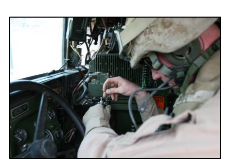
A Marine uses his new tool to repair equipment.