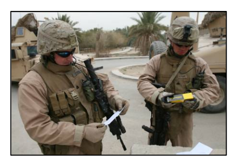
Marines receive the utility tools and read their letters from OTA.

Photos of Marines featured are courtesy RCT-6 unit.