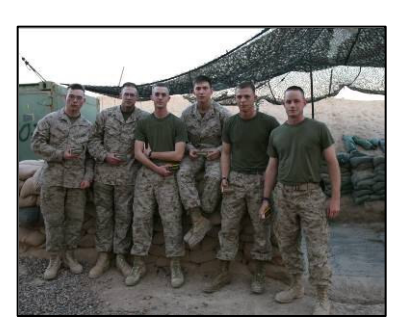
RCT- 6 Marines.