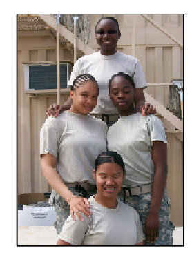
... and the soldiers were grateful: "We want to thank you and all the people who put together those wonderful boxes. All the soldiers were very excited!"