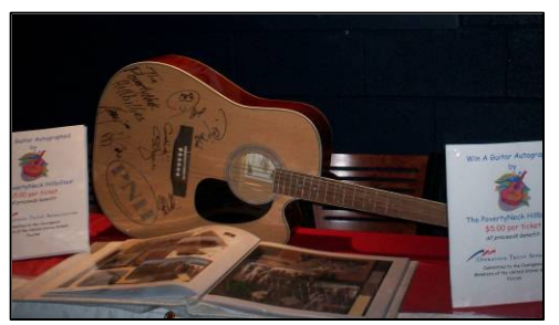
PovertyNeck Hillbillies autographed this quitar for OTA to raffle off at PNH's New Year's concert.

On December 30, 2006 the band held their New Year celebration concert at the Pepsi Roadhouse in Burgettstown, PA. OTA was a special guest at the show and sold raffle tickets for a custom PovertyNeck Hillbilly guitar signed by the band. Thanks to these fine patriots, OTA raised over $1,000 to fund more troop projects.