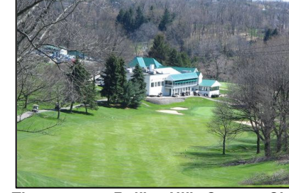
The greens at Rolling Hills Country Club.