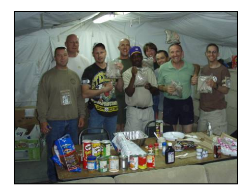
The sailors of this military police unit show off the Under Armour t-shirts and yummy snacks OTA sent them.

Meet some of the troops who have touched our lives. Their smiles are our biggest reward!