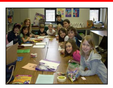
The Religious Education students at St. John Capistran raised over $1800 for OTA soldiers and collected needed items the troops requested.

To meet their goal, the children shared their allowance, or donated money they would have otherwise spent on snacks at school. Some even took money they received for Christmas or their birthday and donated it to help reach their goal.