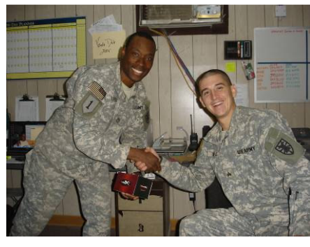
OTA sent this signal company Under Armour t-shirts and ballistics eye glasses.