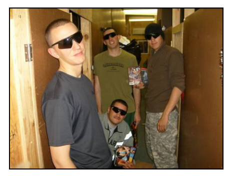
This military police detachment is stationed in a desolate area of Iraq. OTA sent this PA reserve unit DVDs, phone cards, snacks, and magazines.