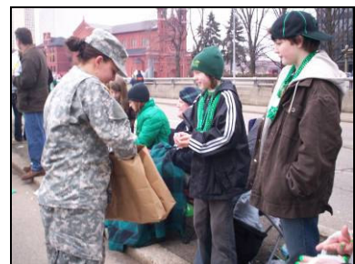
A member of the 316th Military Police Company hands out candy along the parade route.