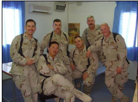
This navy medical team, from Pensacola, FL, is responsible for establishing an Afghani hospital. OTA sent them board games, DVDs, magazines, and other entertainment items.