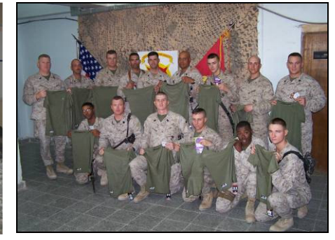
These Marines were thrilled with the Under Armour shirts OTA sent them.