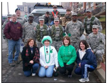
OTA Volunteers and soldiers gather to march in Pittsburgh's 2008 St. Patrick's Day Parade.

As always, the great citizens of Pittsburgh showed their support through cheers, handshakes and lots of hugs as the soldiers handed out candy to parade watchers.