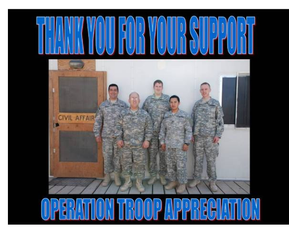
OTA sent the soldiers of this Civil Affairs unit fire retardant tactical gloves.