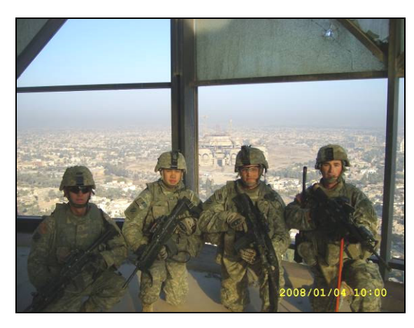
From Ft. Stewart, GA, this Armored unit provides route security, recon, and leads IED counter patrols in Iraq. OTA sent them heavy-duty military watches.